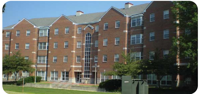
▲ Grunau installed updated wet fire protection systems in Humbert Hall, pictured, along with other student dorms on DePauw’s campus.

In addition to the updated fire alarm systems, sprinkler systems were installed in the dorms, all of which were previously sprinkler-free.